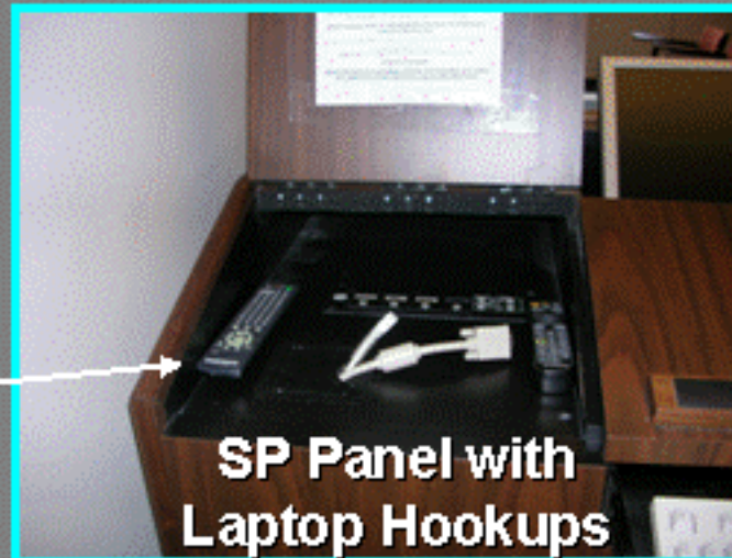
SP Panel with Laptop Hookups

One (1) key opens Equipment door & SP Touch Panel door.